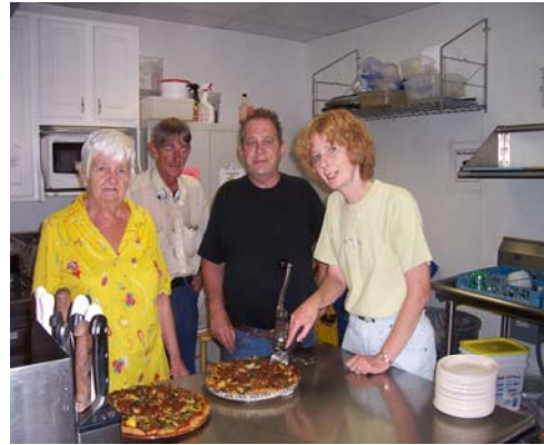
Cooking Class made Veggie Pizza