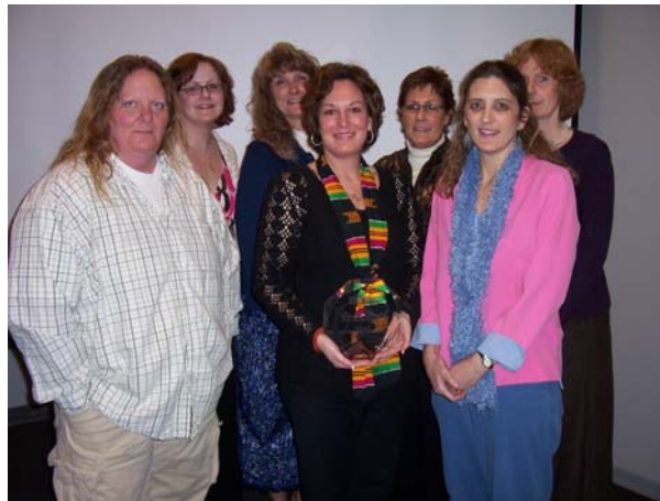
Staff team pose for award recognition